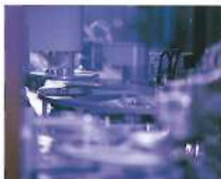
Integrated Unaxis SWIVEL metallizer

Based on Unaxis world-leading sputtering systems, the Unaxis MATRIX is quite simply the best DVD production line available today.